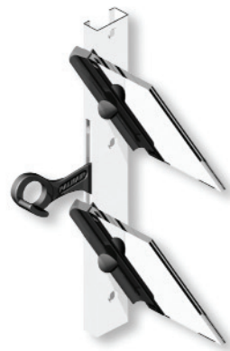
Palmar Louvre Component System