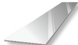
5mm-6.38mm glass blade