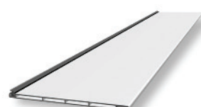
102mm and 152mm 6mm hollow extruded aluminium blade with weatherseal