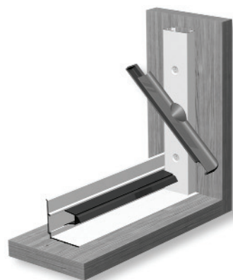
Mullions for Coupling Louvre Sets